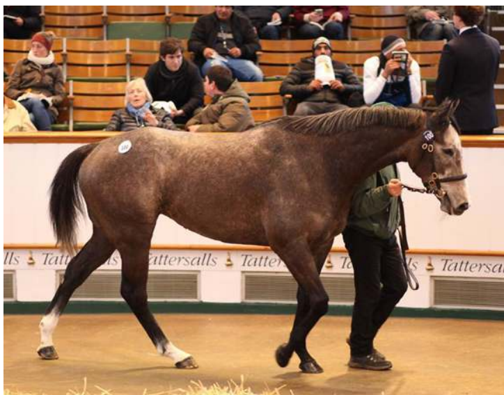
Easton Angel at the February Sale