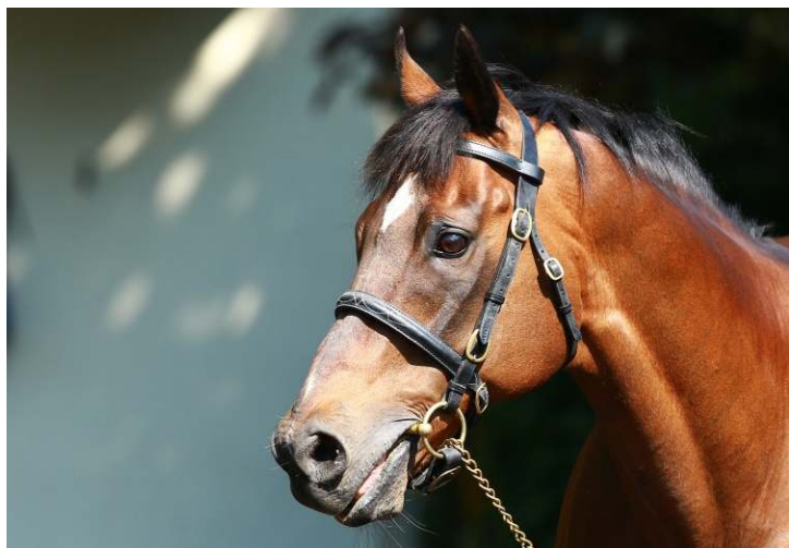
Danehill Dancer | Coolmore Stud

He retired to stud at Coolmore where he made an immediate impact off a low covering fee, while also shuttling to Coolmore Australia. Many breeders who identified his early promise were