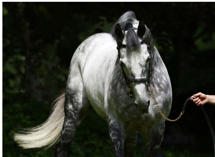
Mastercraftsman | Coolmore Ireland

well rewarded in the sales ring as his fee rose from just Ir£3,500 in 2000 to a high of €115,000 in 2007 and 2008.