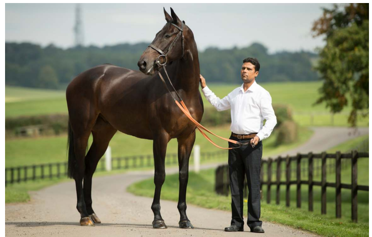
Sprinter Sacre

As usual, it all started with mares. Early in the 20th Century, breeders in the West of France and in the Burgundy area used to provide proper draft horses for the army. Horses were useful in many ways, first for transport and work. The boundaries between racing, eventing and utility horses were more blurred then than they are now. Some horses were actually doing pretty well for most of these purposes, if not all of them: a well conformed dam could take you to mass in style on Sunday, then proceed to the local cross-country event, and go fetch the doctor in the middle of the night. They were the stylish SUVs of the times.