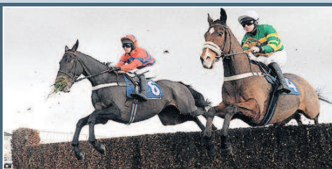
DONCASTER, DECEMBER 9 Won by 24 lengths