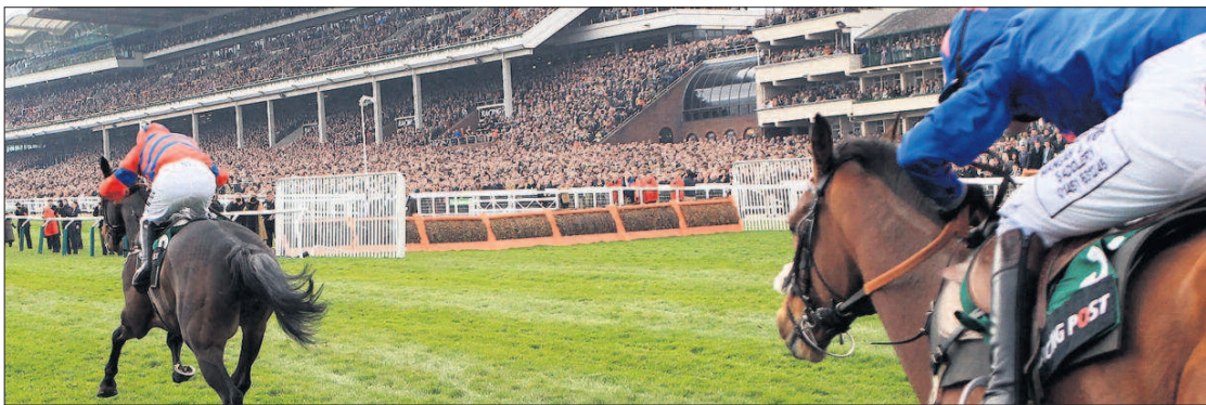
Sprinter Sacre pulls away from Cue Card as he heads for the winning line to record an impressive victory in the Racing Post Arkle

don't remember seeing Sprinter Sacre," admits Henderson. "All I know is that he and Quevega were there at the same show on the same day. Both were also there were to be sold, so I suppose we missed the opportunity."