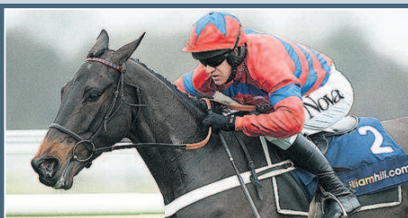
KEMPTON, DECEMBER 27 Won by 16 lengths