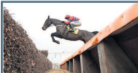
NEWBURY, FEBRUARY 17 Won by six lengths