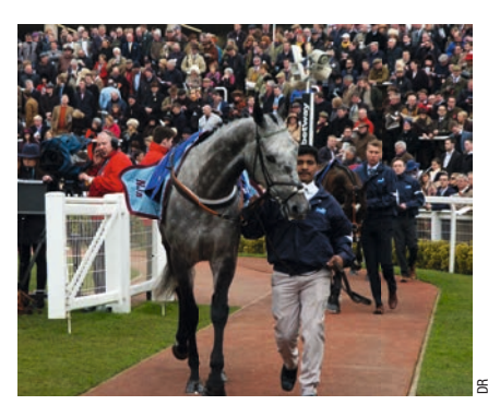
Vyta du Roc