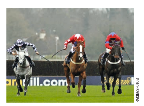
Sprinter Sacré, Sire de Grugy and Vibrato Valtat

In this important chase, in which you have to have speed, he will have to cross swords with two other AQPS bred in France: Sire