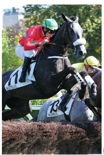
Bristol de Mai sporting his breeder's colours when winning the Prix Isopani at Auteuil in 2014.

the Arkle Chase of Cheltenham in 2016, but after winning his prep by 25 lengths at Plumpton on February 15<sup>th</sup> 2016, he is injured and is unfortunately off.