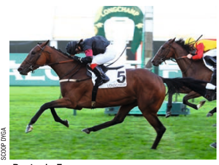
Basta de From

was maiden when she went to stud. But she represents a great family developed by the trainer. Indeed, this family originates from the Labus mare Olchany , who was the dam of Vindhy (Yelpana). The latter is responsible for Honey (Highlanders), who went on to produce the likes of Ograndy (82nd Grand Steeple-Chase de Bordeaux L),