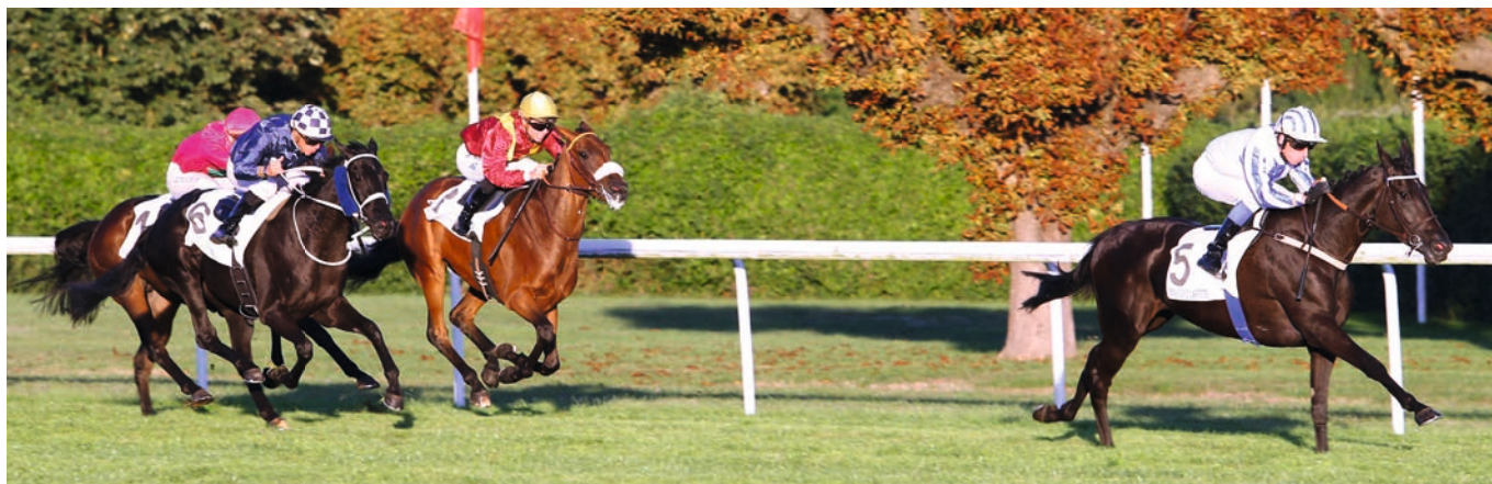
Divine Sainte beating Drive Again, Diderot Vallis and Domino Doré in Prix du Bourbonnais.