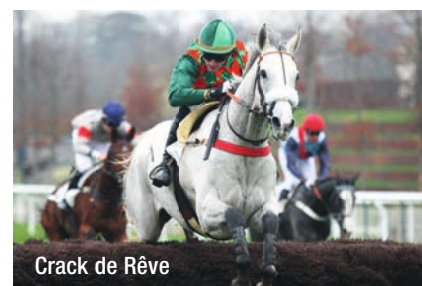
Crack de Rêve