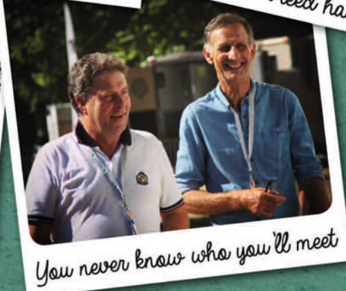
You never know who you'll meet