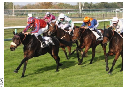
Divine d'Alène winning Prix des Guilledines at Durtal.