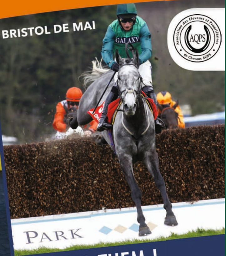
BRISTOL DE MAI