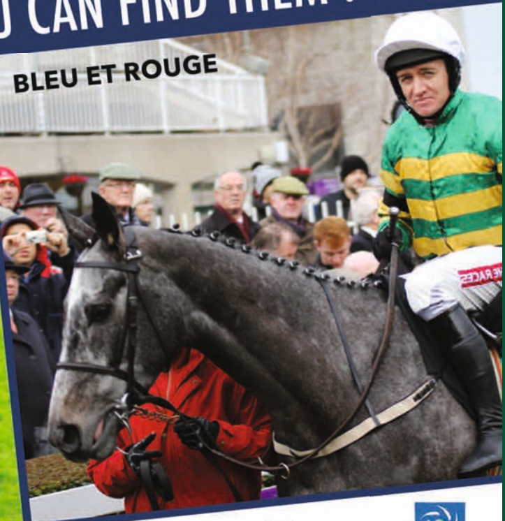
BLEU ET ROUGE