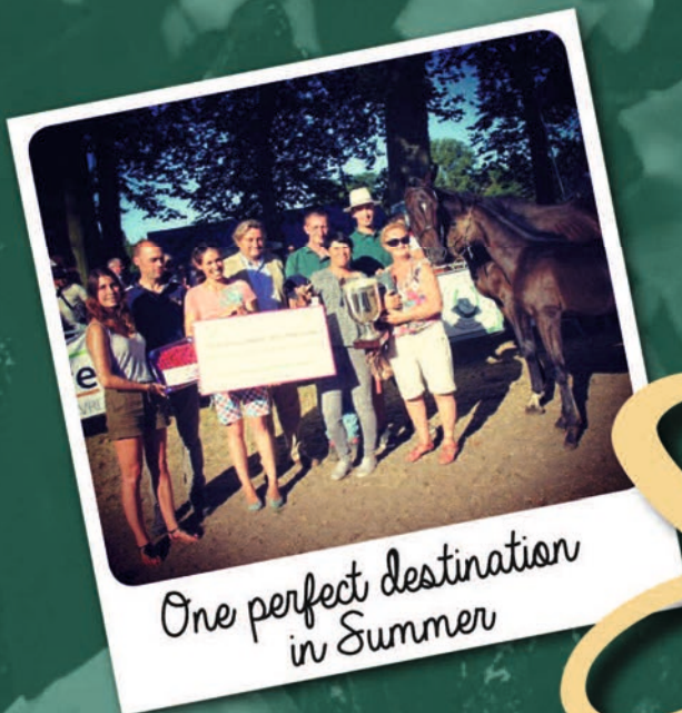
One perfect destination in Summer