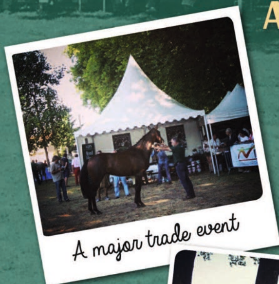
A major trade event