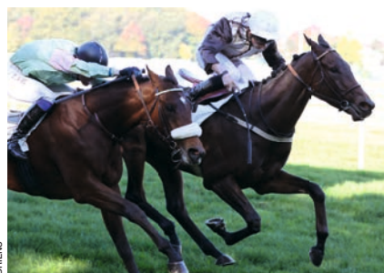
Dis Donc beating Disco Môme in Prix de l'Avenir.