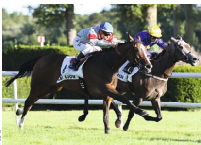
Donasland, here with Daimiel, soon to be seen over the jumps.