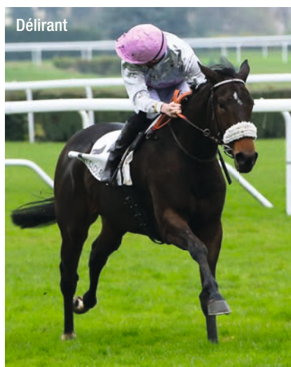
Pierre-Charles Boudot checks out his lead over the field in Prix Jacques de Vienne.