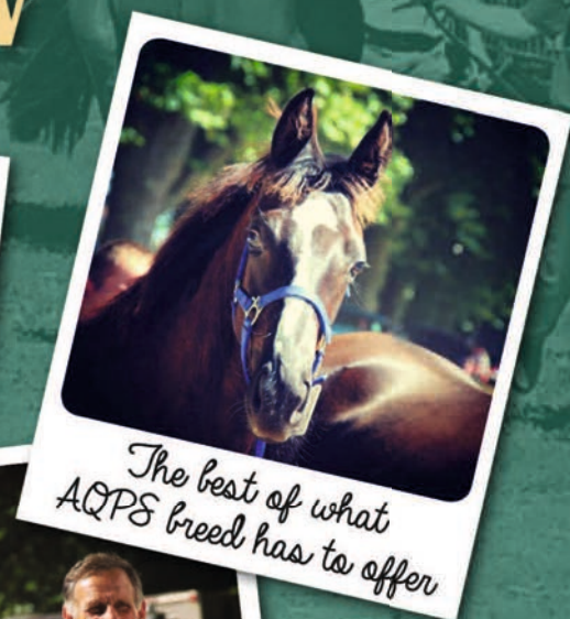
The best of what AQPS breed has to offer