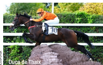
Duca de Thaix