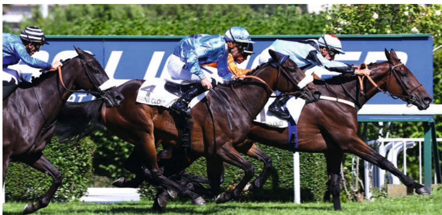
Chambard holds on resist Countister, Bubble Sea and Biennale in Prix de Craon at Saint-Cloud.