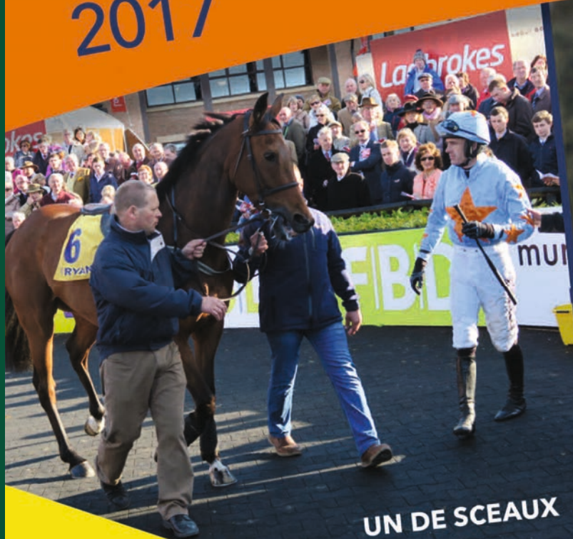
UN DE SCEAUX