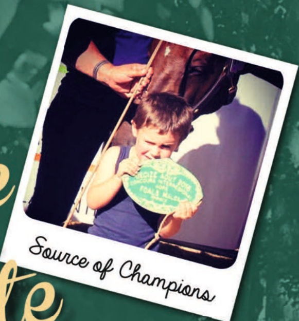
Source of Champions