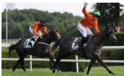
Flasher and Femme de Tête in the Prix de l'Isle Briand.