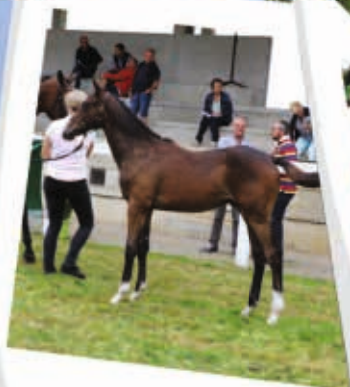
Best Couple Broodmare-Foal ASSELCO