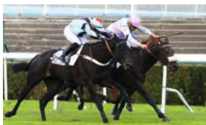
Fan of Sea and Fabuleuse Sween in the Prix du Bourbonnais.