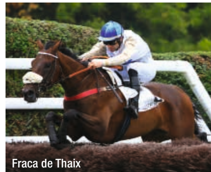
Fraca de Thaïx