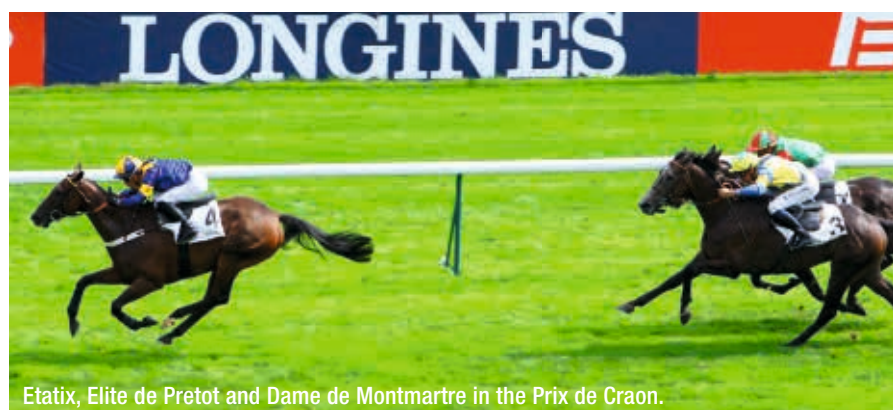
Etatix, Elite de Prétot and Dame de Montmartre in the Prix de Craon.