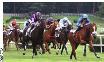
Farafra and Fée de Mée in the Prix Yann Poirier.