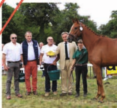
Champion 2yo Gannat