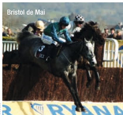
Bristol de Mai

Champion hurdler Buveur d'Air made the front page again on December 1 st at Newcastle. He won the Fighting Fifth Hurdle (Gr1) for the second time, his 7 th Gr1 victory. Nicky Henderson's trainee simply passed by Samcro (Germany), his best challenger on paper, in a matter of strides and the race was over. A few weeks later at Kempton he was more surprised than beaten, finishing second behind his stablemate Verdana Blue (Getaway). He was back on the winning track at Sandown in the Contenders Hurdle (L), just like he did twice already before. ►