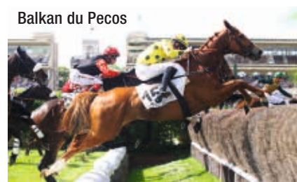
Balkan du Pecos

Fiasco du Pecos (Anzillero), 3 rd in the Prix Richard et Robert Hennessy Chase (L).