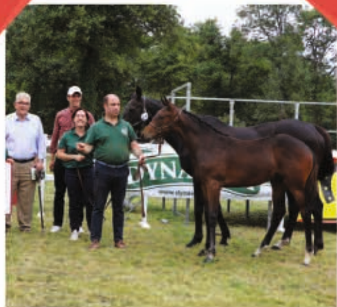
Supreme Champion also champion foal