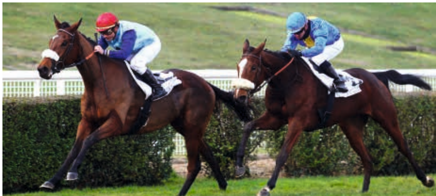
Fabulous Dragoness and Farafra in the Prix Jacques de Vienne