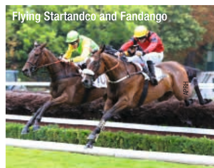
Flying Startandco and Fandango