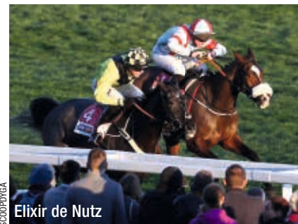
Elixir de Nutz

Winner of the Monksfield Novice Hurdle (Gr3) at Navan, Easy Game prevailed again in the Navan Novice Hurdle (Gr2), beating Défi Bleu (Saddler Maker), an other French AQPS