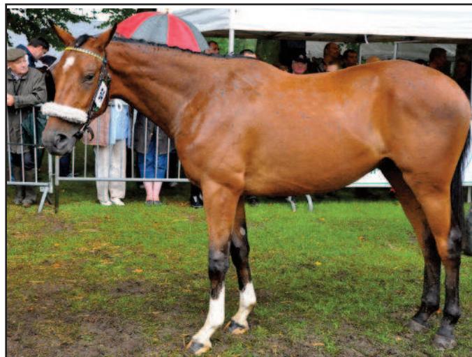
The Shaanmer colt chosen by Willie Mullins to head the two-year-old championship